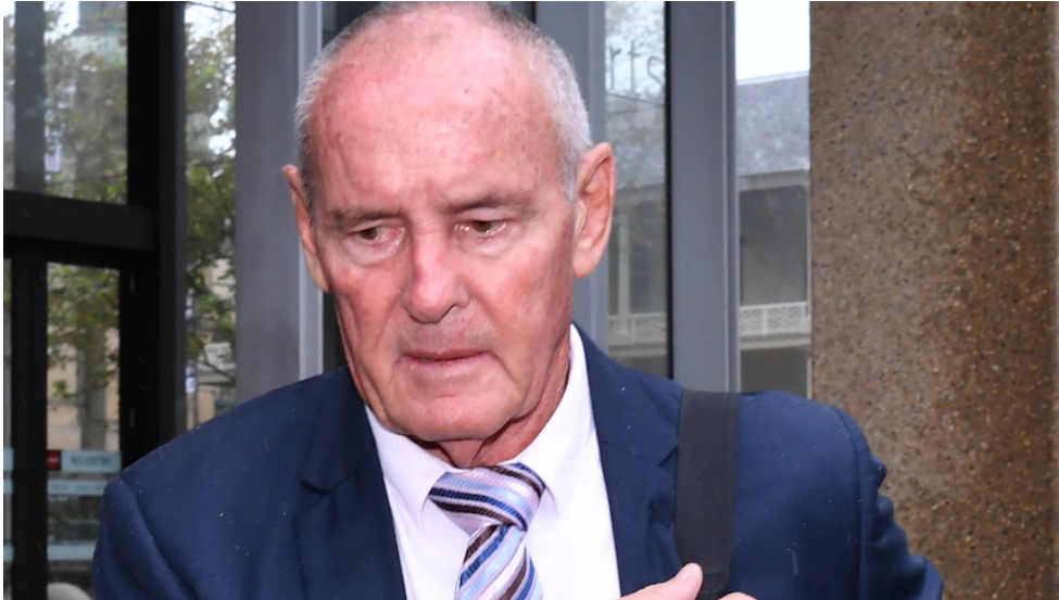
Chris Dawson has pleaded not guilty.